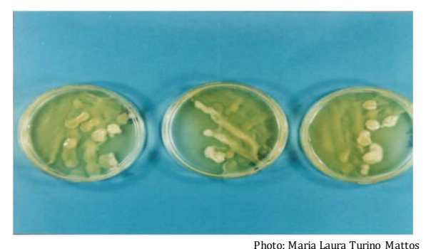
Figure 1. Pseudomonas fluorencens, a degrading

In several countries, the main genera of bacteria isolated from rice-growing areas are: Arthrobacter, Baccillus, Clostridium, Flavobacterium, Micrococcus, Mycobacterium and Pseudomonas.9 In a typical eutrophic hydromorphic PLANOSSOLO cultivated with flood irrigated rice in the Lowlands Experimental Station (ETB) of Embrapa Clima Temperado, Mattos and Thomas (1996) identified a degrading bacterium of the herbicide clomazone: Pseudomonas fluorencens (Figure 1). Also at ETB, fungi isolated from samples of flooded rice straw collected from plots desiccated with glyphosate herbicide were identified as glyphosate degrading bacteria: Nigrospora sphaerica, Cochliobolus heterostrophus, Fusarium anthophilum and Micelia sterilia (Figure 2).10