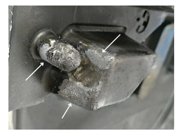
Fig. 1 – Corroded die causing die soldering. The white arrows indicate the most worn regions.

Soldering is derived from corrosion. Usually, corrosion performance is measured by a unit of volume of mass over time. In contrast, die soldering is dependent on the nature of the corrosion products. Fig. 1 shows the corroded surface by molten aluminum and its residue.